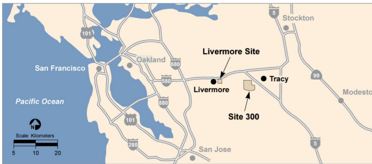
Figure 1-1. Locations of the two LLNL sites—the Livermore Site and Site 300.

LLNL consists of two sites—an urban site in Livermore, California, referred to as the “Livermore Site,” and a rural test site, referred to as “Site 300,” near Tracy, California. See Figure 1-1 .